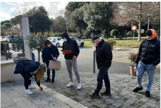
Photos: Games Without Barriers students carrying out the accessibility assessment practical exercise.

The training event and experience in general was evaluated very positively from both the participated students and teachers.